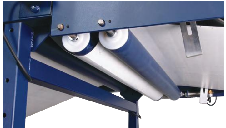
Automatic belt tracking for ease of use and longer belt life.

Tarp designs and manufactures a complementary range of capable, affordable, and maintainable fabricating equipment. Contact us for more information.