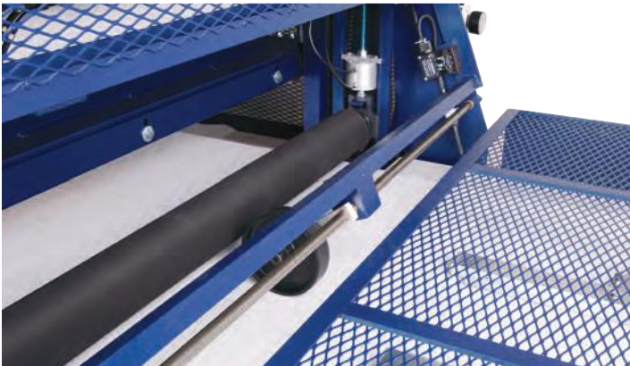
Detail of adjustable rubber-coated pinch roller and sheet sensor wheel.

Touch-screen interface (mounts on a moveable console) enables easy set-up, easy adjustments, and easy recipe saving.